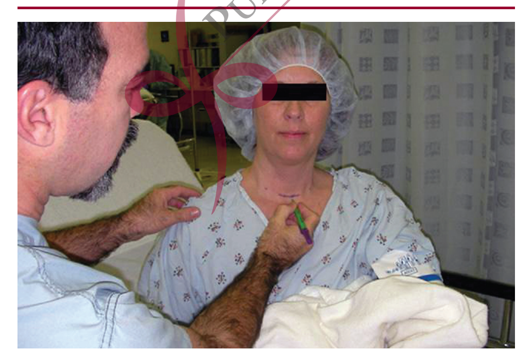
Figure 13-1. The planned cervical incision site is marked while the patient is awake and sitting upright in the preoperative holding area. (Reprinted from Terris DJ. Novel surgical maneuvers in modern thyroid surgery. Operative Techniques in Otolaryngol ogy . 2009;20(1):23–28. With permission from Elsevier.)

Also different from some European practices, an ultrasound is repeated by the surgeon once the patient is in the final surgical position. This confirms the findings of the preoperative studies and helps guide the anticipated dissection. The planned inci-