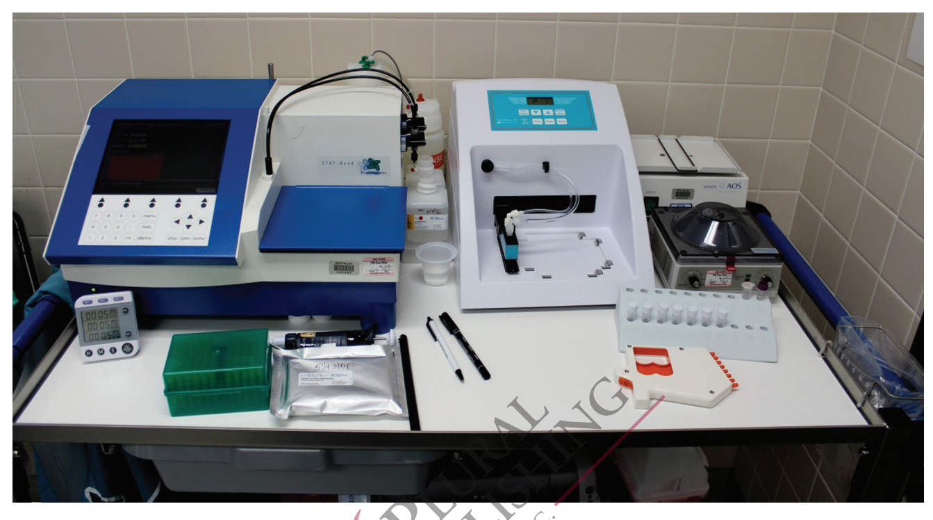
Figure 13-3. Mobile equipment for performing the PTH assay in the operating room.