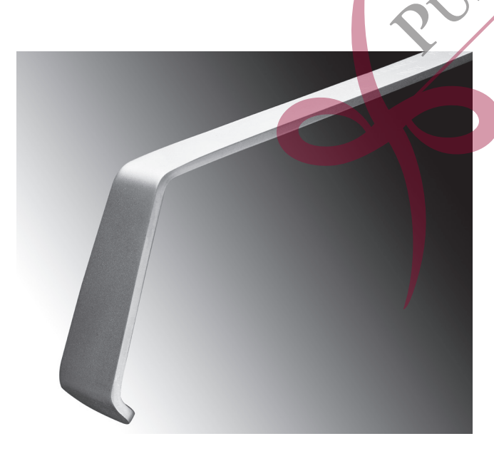
Figure 13-4. Terris Thyroid Retractor.

rubbery, and a dark mahogany in color. Gentle dissection through any overlying fat may help reveal the enlarged glands. The recurrent laryngeal nerve