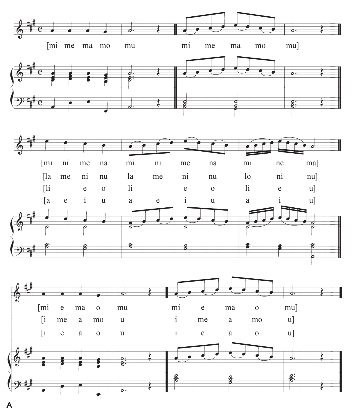
Figure 5-1. A. Exercise for developing a coordinated onset (attack). Begin each new pitch with an (I), (m), or (n) in this exercise to help you become aware of the correct sensation at the onset of each vocal tone. It is very difficult, if not impossible, to begin a tone with a glottal or aspirated onset when beginning with a voiced consonant. Perform these exercises at low, medium, and high pitch levels. Once you have an understanding of the correct sensation of a coordinated onset, begin to remove some of the voiced consonants and continue doing the exercise until you can begin each tone with a coordinated onset on the vowel alone. (continues)