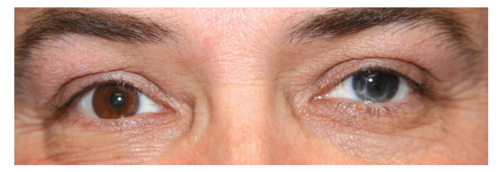
FIGURE 4–4. Eye trauma can sometimes approximate the appearance of heterochromia iridis. The eye on the left has lost brown pigment because of a traumatic accident in this man's childhood. His normal eye is brown.

this condition causes eye pain when the eye is exposed to strong sunlight. Corrective surgery or protective contact lenses may be needed to treat the problem. Patients remember eye trauma. Always ask the patient about the cause of an anomaly before assuming that it is genetic.