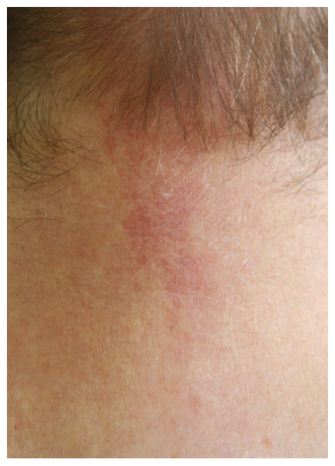
FIGURE 4–3. Port-wine stain is a vascular anomaly often located on the back of the neck. This individual has a port-wine stain extending from the base of the neck, well into the skin of the scalp. Port-wine stains often fade or diminish in size over time.

neck for port-wine stains, freckles, moles, or depigmented areas of skin in otherwise normally pigmented skin. Observe the patient's hair for white or silver hair in otherwise dark hair, or for uniformly silver or very white hair.